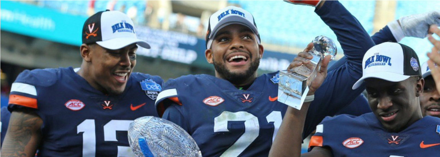
Virginia won the 2018 Belk Bowl over South Carolina, 28-0. It gives UVA its third Belk Bowl win, which is the most by any school in Belk Bowl history. UVA won the first two Continental Tire Bowls in 2002 and 2003. Since 2011, the Charlotte bowl has been known as the Belk Bowl. The shutout of South Carolina was the first time an SEC team was shutout in a bowl game since Florida in the 1975 Gator Bowl.