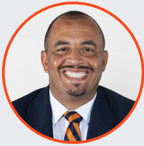
FRALIN FAMILY HEAD FOOTBALL COACH