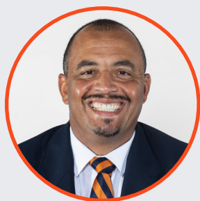
FRALIN FAMILY HEAD FOOTBALL COACH