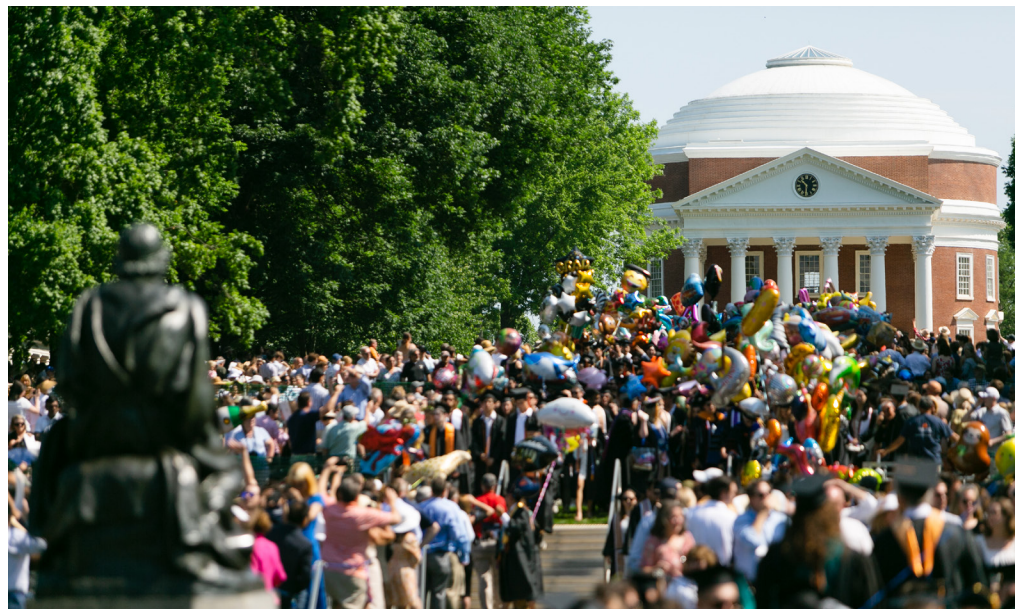
UVA held its first graduation ceremony – referred to as “Final Exercises” – in 1829, following Thomas Jefferson’s original plan that omitted commencement and diplomas. Since 1953, Final Exercises have been scheduled to take place on The Lawn, weather permitting.