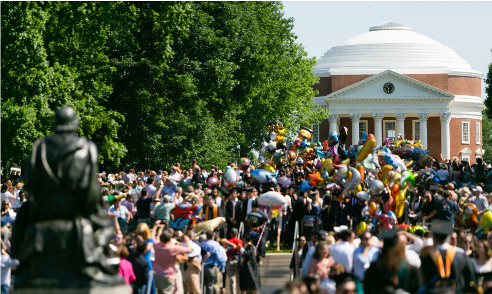
UVA held its first graduation ceremony – referred to as “Final Exercises “ – in 1829, following Thomas Jefferson’s original plan that omitted commencement and diplomas. Since 1953, Final Exercises have been scheduled to take place on The Lawn, weather permitting.