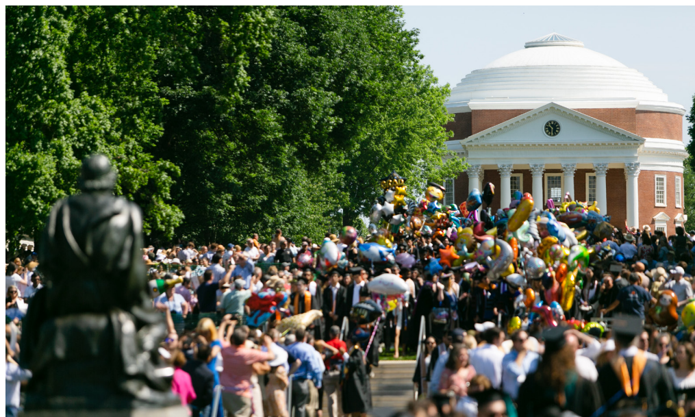
UVA held its first graduation ceremony – referred to as “Final Exercises” – in 1829, following Thomas Jefferson’s original plan that omitted commencement and diplomas. Since 1953, Final Exercises have been scheduled to take place on The Lawn, weather permitting.