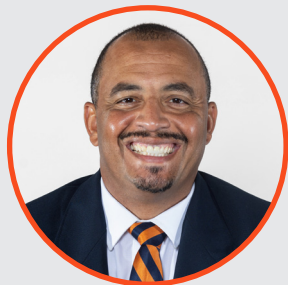
FRALIN FAMILY HEAD FOOTBALL COACH