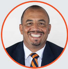
FRALIN FAMILY HEAD FOOTBALL COACH