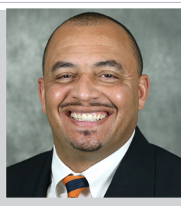
FRALIN FAMILY HEAD FOOTBALL COACH