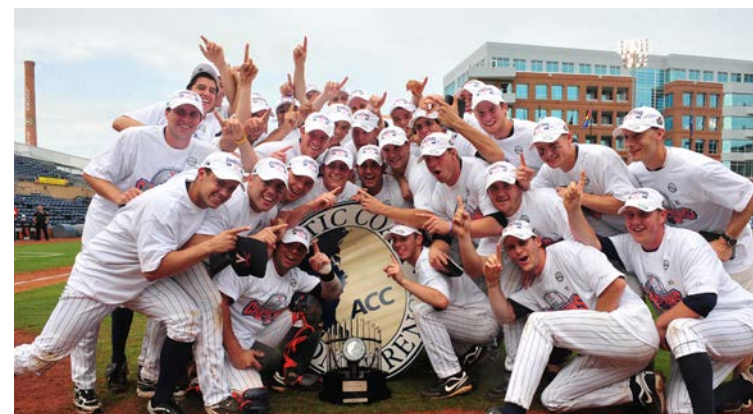
2011 ACC Champions