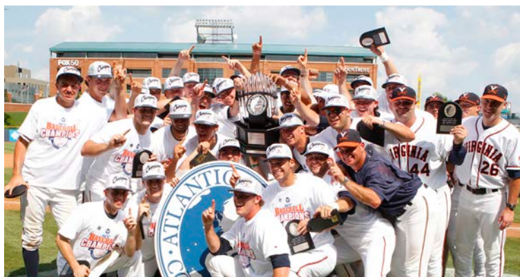
2009 ACC Champions