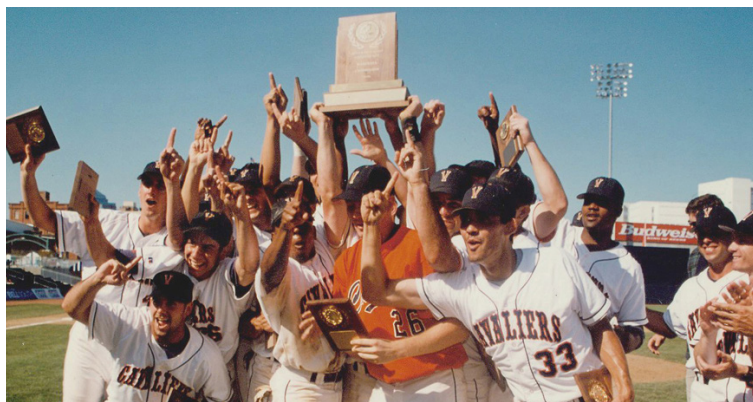
1996 ACC Champions

May 25 #9 Florida State ..... L, 3-13 (8) May 27 #4 Notre Dame ..... L, 0-3